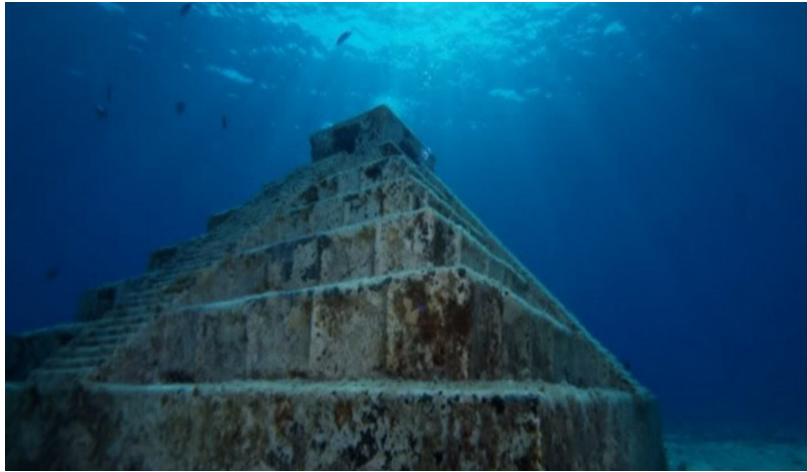
The Yonaguni Pyramid